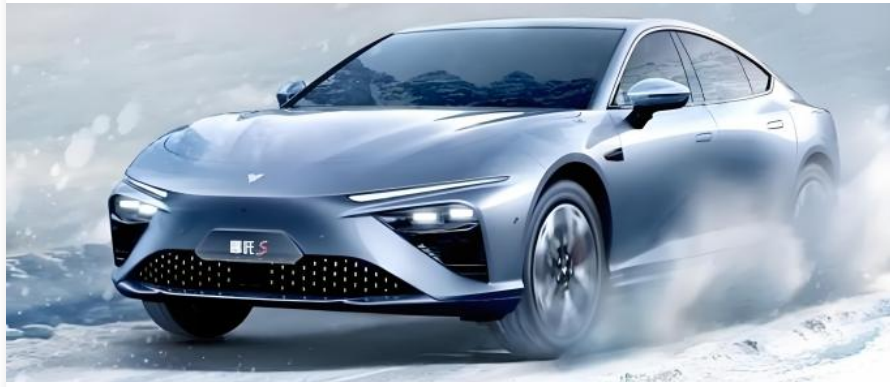
The "Neta S"