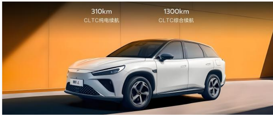
The " Neta L"