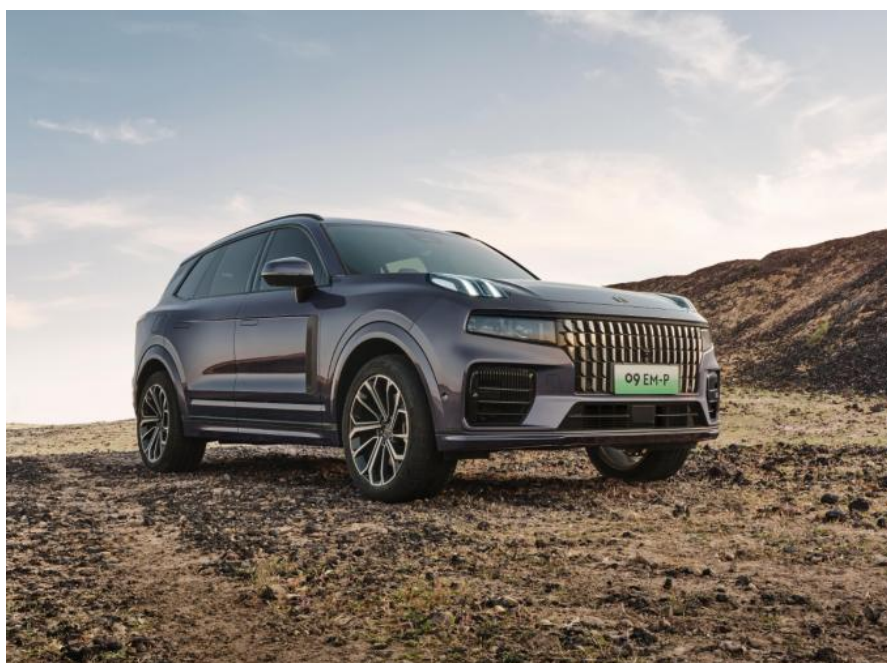
LYNK & Co 09 EM-P