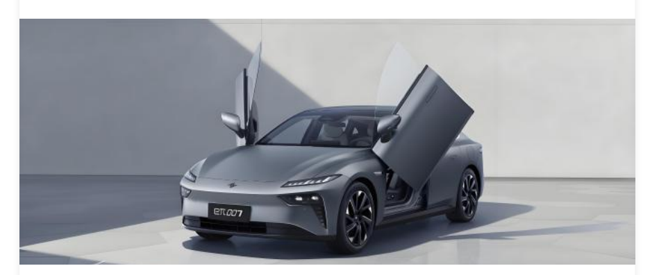
The Dongfeng "E \pi 007"