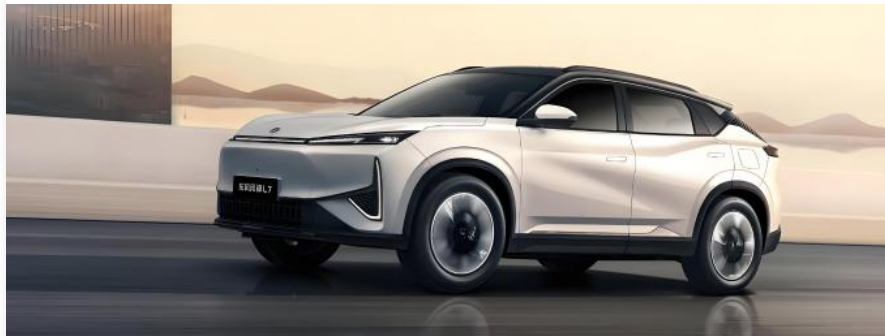
The Dongfeng " Acolus L7 PHEV"