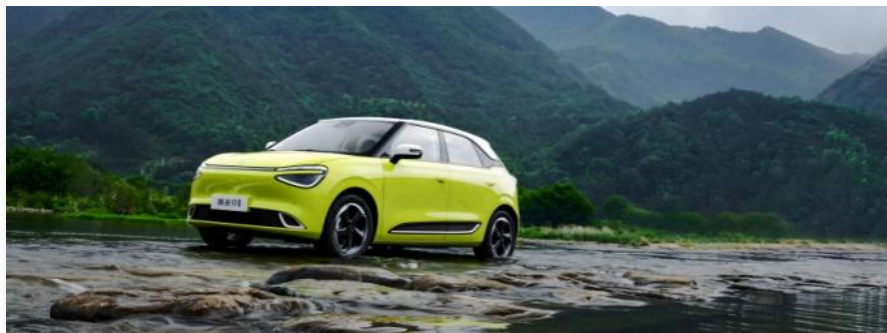
The Dongfeng "Nammi 01"