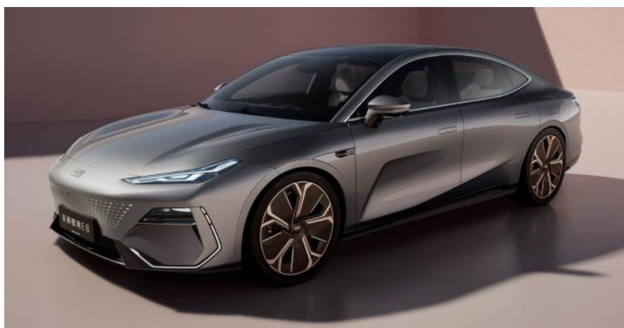
Geely Galaxy E8