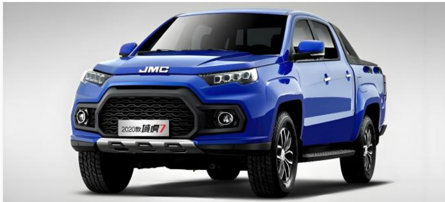
The JMC "Yuhu 7"