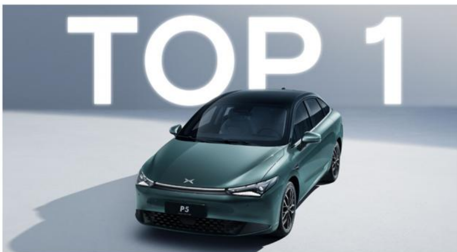
PERSONALIZED APPEARANCE DESIGN LANGUAGE