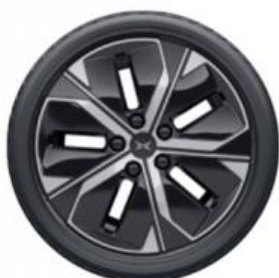
18-INCH AUTOMOBILE RIM