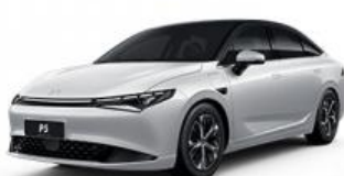
○ BRIGHT WHITE $ 420