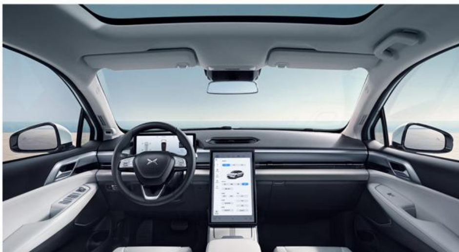
EXCLUSIVE CUSTOMIZED AUTOMOBILE INTERIOR DECORATION