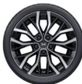
19-INCH AUTOMOBILE RIM $ 420