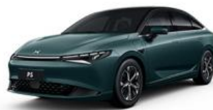
● DARK GREEN $ 420