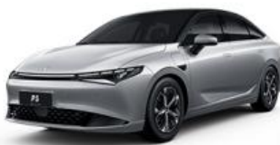
○ BRIGHT SILVER $ 420