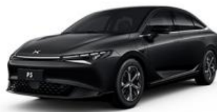
● BRIGHT BLACK