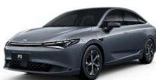
● DARK GRAY