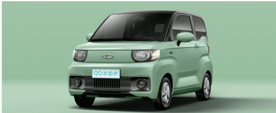
The Byd "Dolphin"