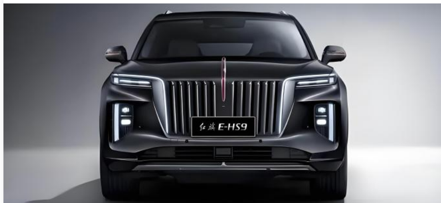
The Hongqi "E-HS9"