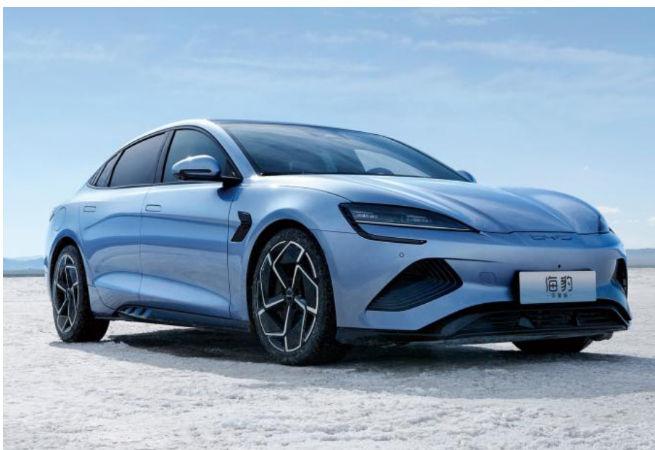
BYD Seal Honor Edition