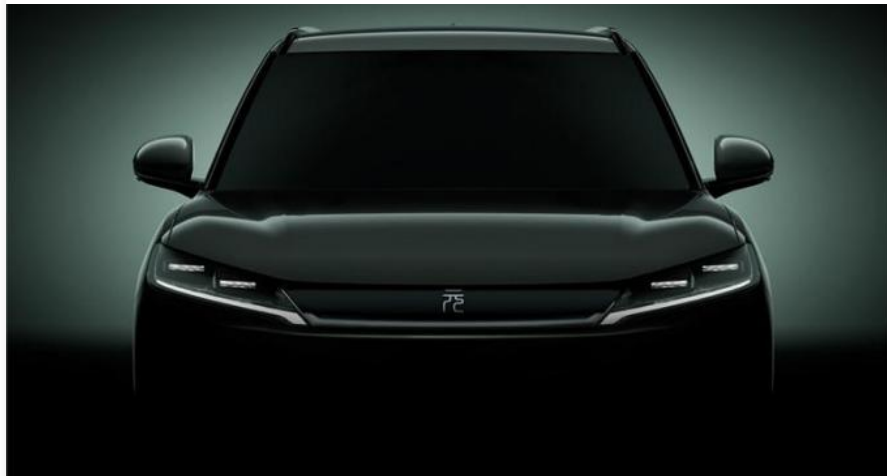
The Byd "Yuan UP"