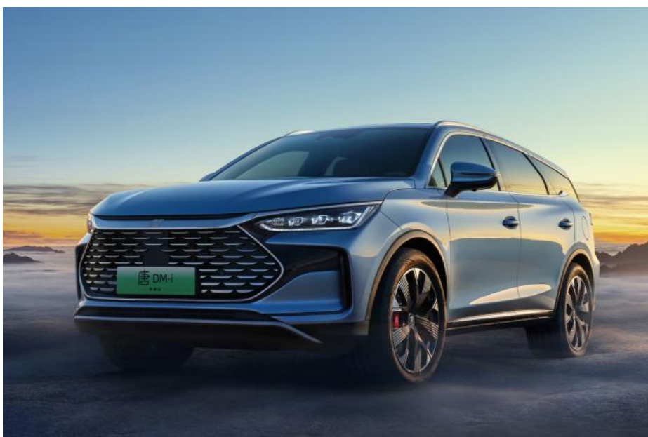
BYD TANG DM-i