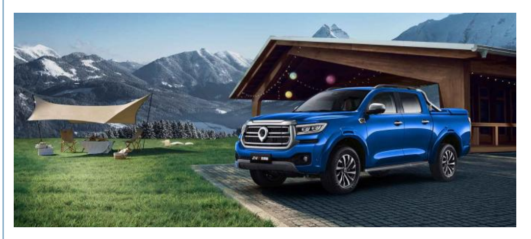
The Changcheng "Pao"