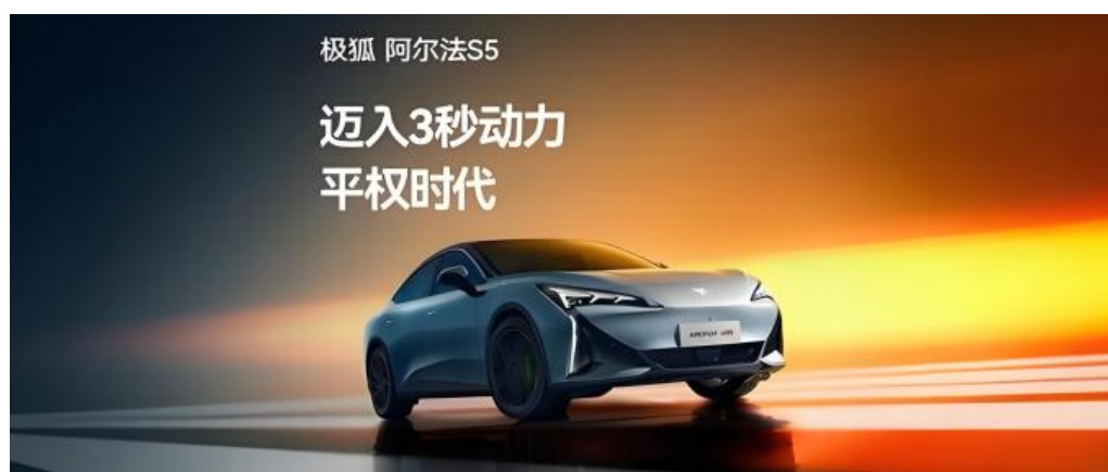
The ARCFOX "Alpha S"